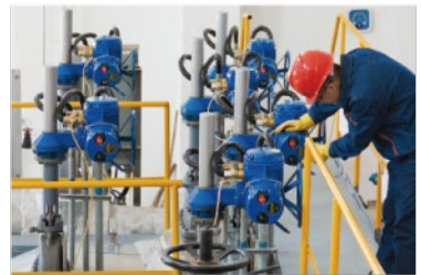
▲ Other Industries