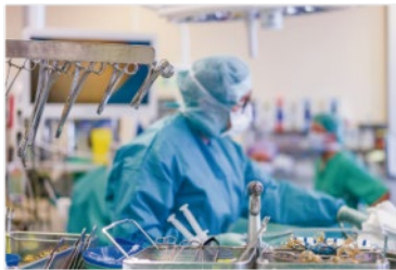
▲ Food & Pharmaceutical Industry